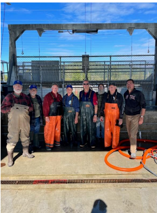
Both clubs working together