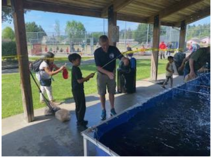
Algona Mayor helping kids catch fish