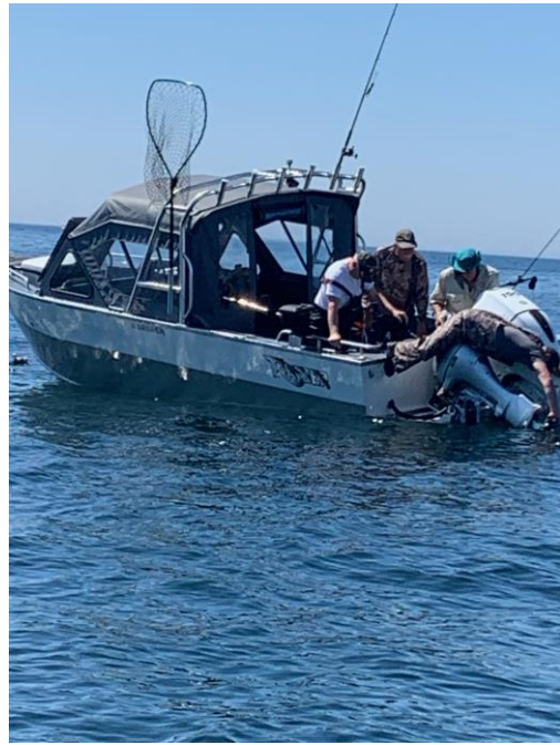
Results of turning too sharp at swift shore