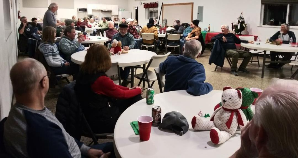
The Silent Auction was a big hit. Many folks came away with some great deals.